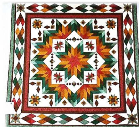
"Taos" Quilt by Lorna Fairbanks

Summer Studios for YOUdio! Book a "Summer Studio" rental in July & August at the Quail's Nest. Minimum 3 days, maximum 6 for $60.