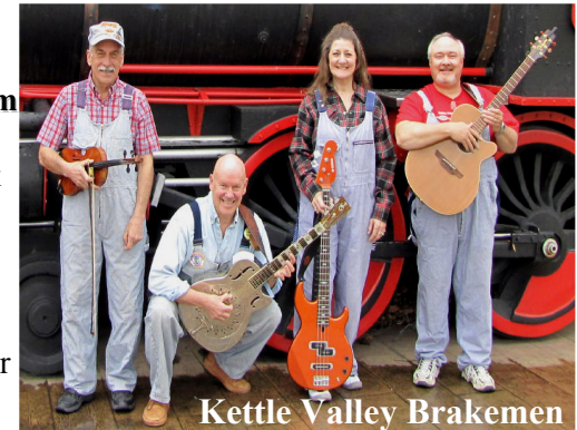
Kettle Valley Brakemen

are hiring Johnson Excavating to remove the tarmac, cement fixtures, and some “weed trees” from the grounds at the Quail's Nest. They will then resurface the central parking lot with 4” of compacted crush, an environmentally friendly alternative to pavement. A patio area 20' wide running the length of the south side of Big Blue will also be dug out. Terracing and paving that area will be a later phase in the project, with a separate bid process. Work will occur in late July, avoiding those dates already rented for Studio.